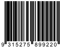
Thunder Battery Box Part No. TDR02007